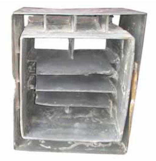
Comparison of weld overlay protected coal nozzle tip (top) and the Kennametal tip (bottom) from coal entry side.

Kennametal Inc. 501 Park East Boulevard New Albany, IN 47150 USA