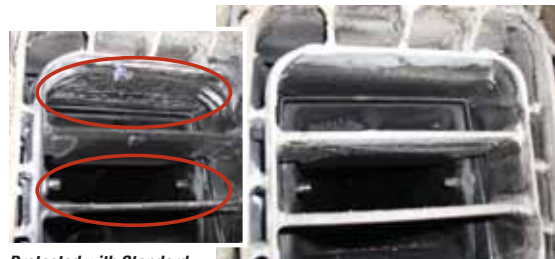
Protected with Standard Weld Overlay

* Conducted by EPRI — Electric Power Research Institute