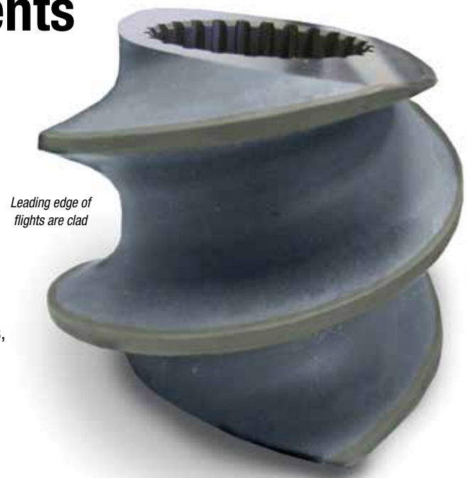
Leading edge of flights are clad